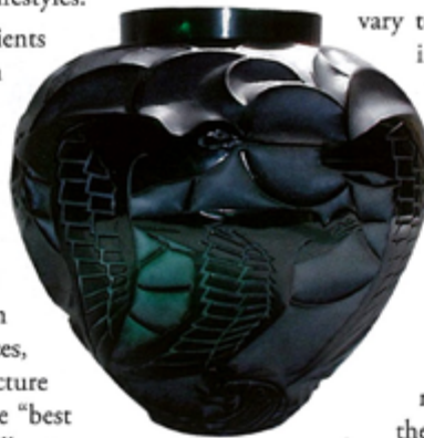
Lalique, "Courlis" Vase.